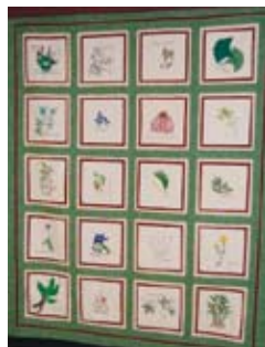
The drawing for this quilt will be Friday, Feb. 13, 2009.