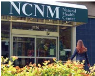
NCNM Natural Health Center